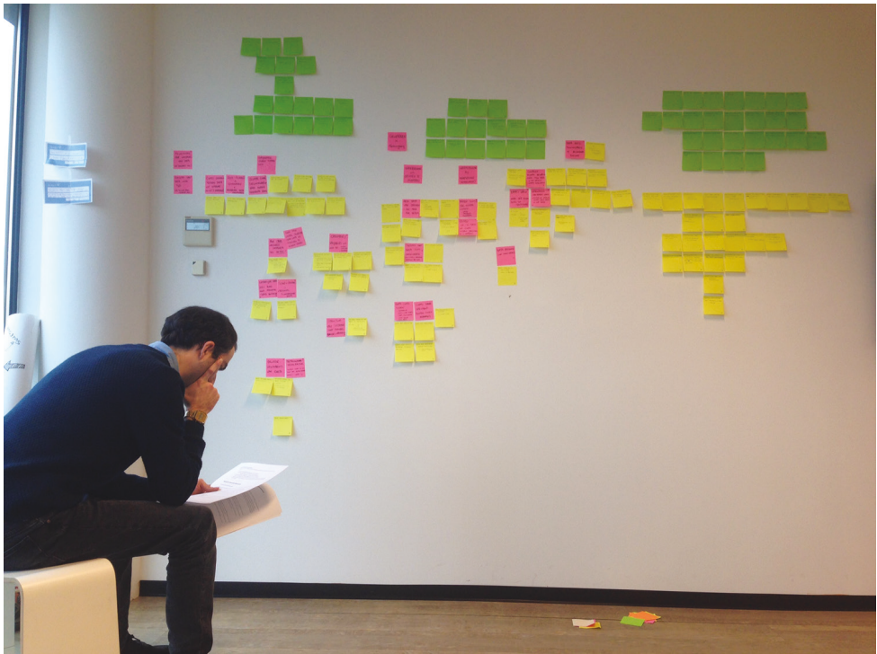
Figure 2. A user experience researcher using affinity diagramming to cluster user requirements from the results of the interviews.

The final step in the analysis approach consisted of manual clustering of closely related needs and insights. These clusters helped to identify overlap among the requirements that were proposed by the different types of researcher. These overlaps served as the basis for defining common user requirements.