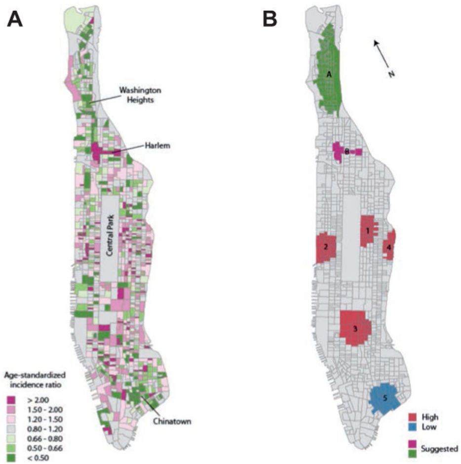
Figure 2. Breast cancer incidence, Manhattan, 2005-2009. Standardised incidence ratios (A) and by block group (B). Clusters as defined by the spatial scan statistic (red and blue) and other areas of interest suggested by the signal intensity ratio map (magenta and green).