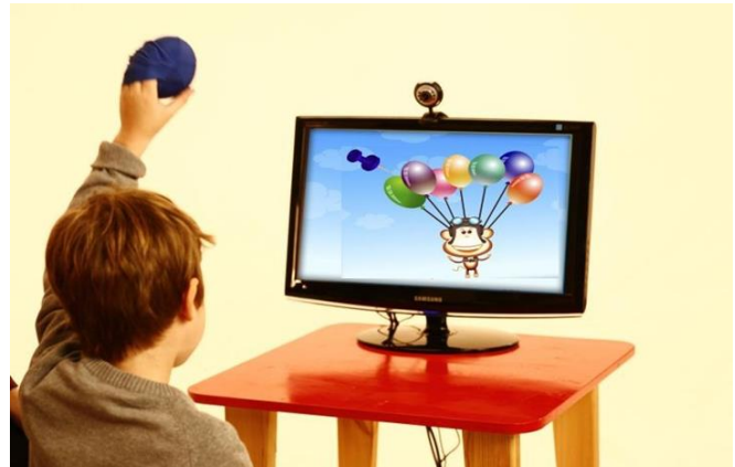
Figure 1. Timocco game set-up. The webcam is tracking the motions of the child by capturing the image of the gaming ball. In this image, the child's goal is to virtually "pop" the balloons with the "push pin," on the screen, which moves in real-time as the child moves his left upper extremity.

The research team introduced the Timocco program to the school, one year prior to the initiation of the research study. At that time, all teachers and staff received virtual training from Timocco representatives. Teachers and staff had the opportunity to informally utilize Timocco for all