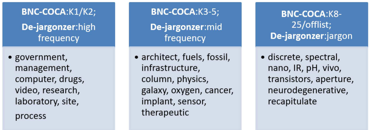
Fig 3. Examples of words that were classified similarly by the De-jargonizer and the BNC-COCA. Each column shows the levels and the corresponding words found to be classified similarly. Note: levels K1+K2 are first most frequent 2,000 word families according to BNC-COCA; each K = 1,000 word families up to K25, followed by offlist words beyond K25.

https://doi.org/10.1371/journal.pone.0181742.g003