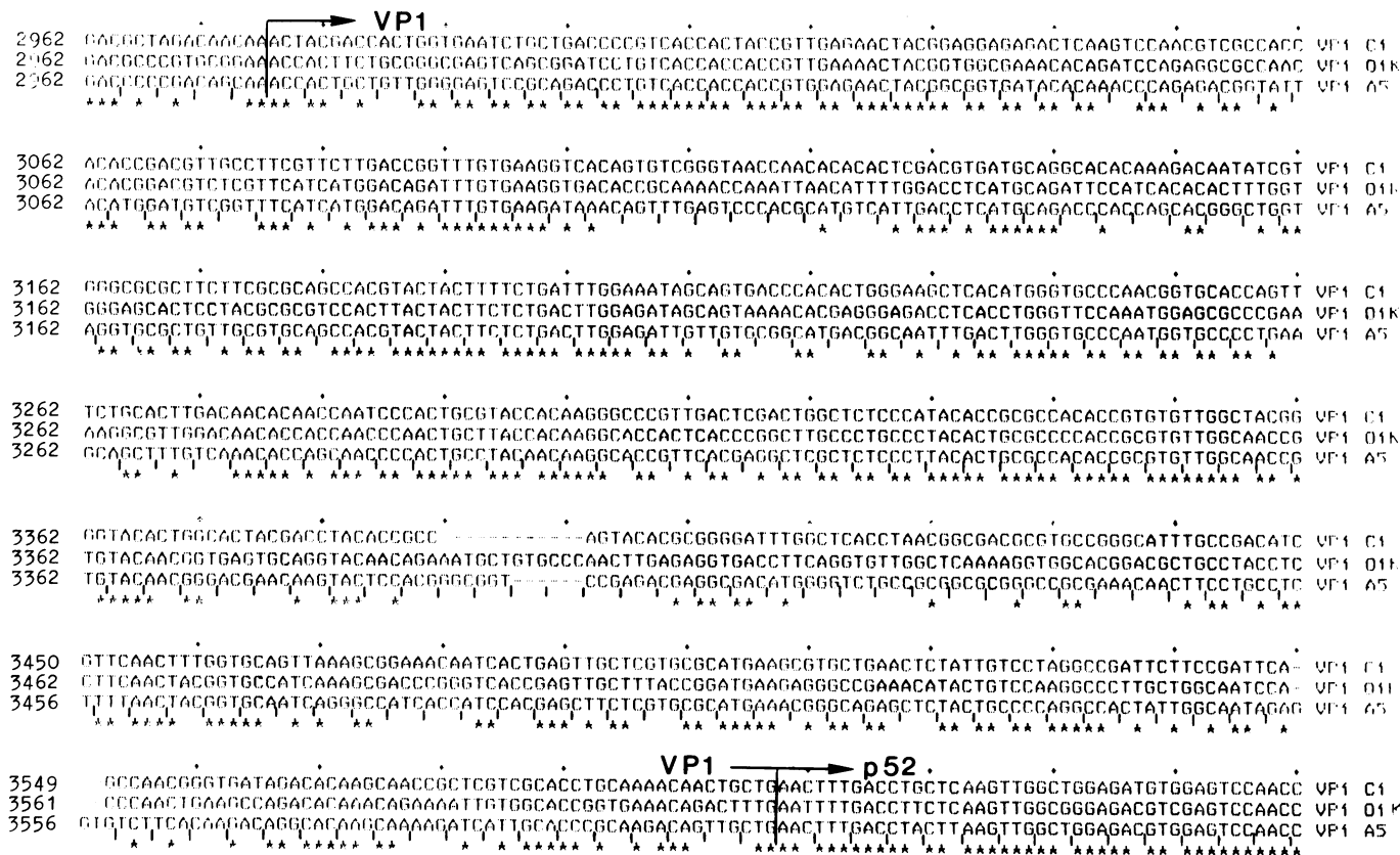
Fig. 2. Comparison of the VP1 encoding nucleotide sequences of FMDV serotypes C 1 , O 1 K and A 5 . The sequences are aligned according to homologies in the more constant regions. The somewhat arbitrary alignment around position 3400 corresponds to the amino acid alignment in Figure 3. The numbering refers to the O 1 K nucleotide sequence (Kurz et al. , 1981). Strokes represent deletions used to optimize alignment and asterisks indicate identical nucleotides in all three serotypes.

To determine the borders of the VP1 gene, the nucleotide sequences from serotypes C 1 and A 5 were aligned to the O 1 K sequence (Figure 2) for which the gene limits have been identified using amino acid sequence data from the gene product (Strohmaier et al. , 1978; Kurz et al. , 1981). Although there are stretches of high variability between the nucleotide sequences of the three different serotypes, the regions encoding the termini of VP1 were sufficiently conserved to allow an unambiguous alignment. From the homology to the O 1 K nucleotide sequence, we conclude that in FMDV C 1 and FMDV A 5 the VP1 coding sequences start with nucleotide 2977 and stop at positions 3603 and 3612 in C 1 and A 5 ,