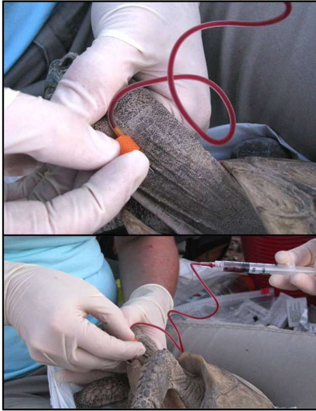
Figure 1: Photograph of blood (~3 ml) being extracted from an adult Agassiz desert tortoise ( G. agassizii ) in Clark County, NV, USA. Blood was collected via jugular venipuncture using a 1.91-cm, 25-gage needle-IV infusion set and 3 ml syringe.

Bowen et al. , 2015, Drake et al. , 2016). Gene transcription cycle threshold values ( C_T ) were measured for the housekeeping gene (18S) and the genes of interest: CaM-Calmodulin, AHR-Arylhydrocarbon Receptor, Mx1, HSP70-Heat Shock Protein 70, SAA-Serum Amyloid A, MyD88-Myeloid Differentiation Factor 88, CD9, SOD, ATF, CL-Cathepsin L and Lep-Leptin (Supplementary Table 1) from each sample in duplicate using quantitative PCR. Amplifications were conducted on a StepOnePlus™ Real-Time PCR System (Thermo Fisher Scientific, Hanover Park, IL, USA). Gene transcription measures were normalized by subtracting the average 18S housekeeping ribosomal gene C_T value from the gene of interest C_T for each tortoise.