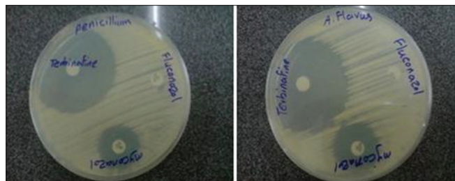
Figure 2: Zone of inhibition (mm). Inhibition caused by the discs ready antifungal activity (fluconazole, terbinafine, and miconazole) on two species of fungi ( Penicillium notatum the left side) and (right side Aspergillus flavus ). (Shape 2) Zone of inhibition (mm)

which Lactobacillus delbrueckii , L. alimentarius Lactobacillus fermentum , Lactobacillus delbrueckii was observed they had antifungal effects. Aryantha and Langgani The fungal inhibitory activity of LAB is very complex. Hopefully, this thesis has contributed to clarify some aspects of this activity. That LAB with fungal inhibitory properties can be useful in biopreservation of both food and feed, alone or in combination with other microorganisms. [27]