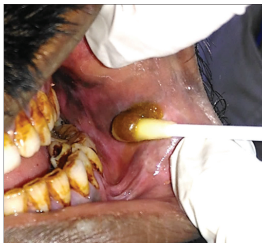
Figure 1: Application of gel at the site of lesion

The therapy was followed up for the next 3 months. Patients were examined on the 30 th day to assess the change in the size of the lesion at the baseline [Figure 2] and posttreatment [Figure 3]. The evaluation of the treatment was assessed by quantitative bidimensional measurement using clinical photographs of the lesion and measuring the size of the lesion by Photoshop software version 5. The two longest diameters calculated by the software were used to calculate the total size of the lesion. The measurements were done twice, first at the baseline (before application of the gel) and at the posttreatment (end of 1 month). The data obtained were statistically analyzed using paired t -test to evaluate the correlation in C. officinalis group and