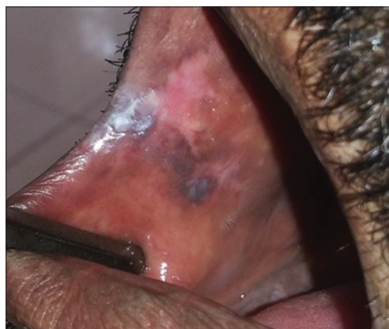
Figure 3: Posttreatment after application of C. officinalis gel