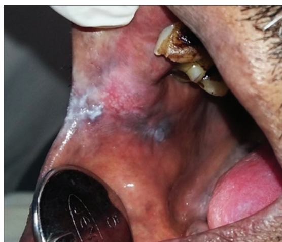
Figure 2: Pretreatment homogeneous leukoplakia