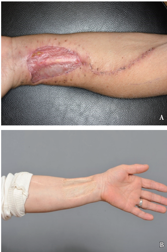
Fig. 3. Radial forearm free flap donor site. (A) This donor site was repaired with split thickness skin graft. (B) Full-thickness skin graft was used to resurface the donor site.

Oral and oropharyngeal cancers should be treated with consideration of functional recovery. Multidisciplinary treatment strategies are necessary for maximizing disease control and preserving