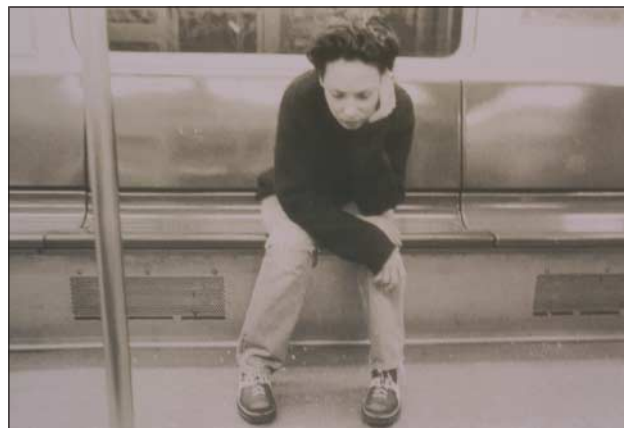
Mental health problems can affect adolescents' quality of life