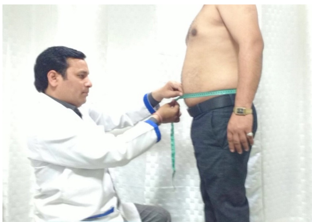
Fig. 1. Waist circumference measurement in a 45 year old male patient with weight 72 kg and BMI 32 kg/m. The subject should be in the fasting state and standing erect and the observer should be sitting in front of the subject. Waist circumference is measured with a non-stretchable flexible tape in the horizontal position, just above the iliac crest at the end of normal expiration. 9 In this case waist circumference was 105 cm, much above cut-offs for men (see text for details).

Patients should be examined for physical characteristics associated with obesity (Table 1). Acanthosis nigricans (Fig. 1), excess dorso-cervical fat deposition (Fig. 2), hepatomegaly, xanthalesma and arcus are some of the commonly observed