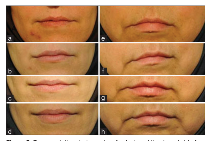
Figure 2: Representative photographs of volunteers' lips (a and e) before treatment, (b and f) 2 weeks after treatment, (c and g) 12 weeks after treatment and (d and h) 24 weeks after treatment