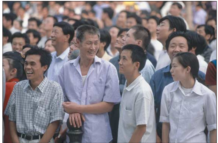
Cohort characteristics can confound only if they vary between comparison groups

Perhaps the most common strategy to identify important imbalances in individual confounders between intervention and comparison groups is to use significance tests such as \chi^2 tests (for dichotomous variables) or t tests (for continuous variables). A problem with these tests is that the significance levels are sensi-