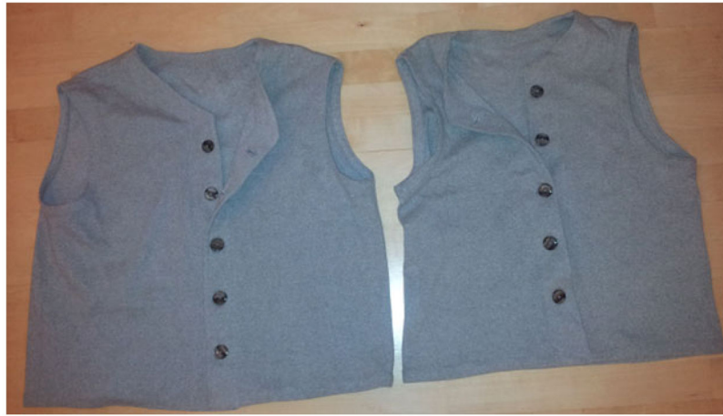
Figure 1. Cardigans used for buttoning/unbuttoning. The male version is left, the female right.