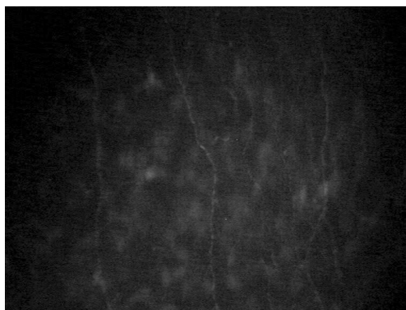
Figure 1. Bowman's layer of a control eye imaged with confocal microscope

Qualitative observations of the corneal cell morphology in the keratoconus group were noticeably different from those of the healthy eyes. Epithelial cells were not clearly visible in all keratoconic eyes. Analysis was not conducted because of poor image quality. Bowman's layer was observed as amorphous layers in the keratoconic eyes, similar to the healthy eyes (Figure 1). However, Bowman's layer was not clearly visible in three (6.3%) eyes with stage 3 keratoconus, in which the sub-basal nerve fibres were visible along with the stromal keratocyte in Bowman's plane (Figure 2). The sub-basal nerve fibres in the keratoconic eyes were more tortuous (Figure 3) than the straight vertical orientation of nerves seen in the healthy eyes (Figure 4).