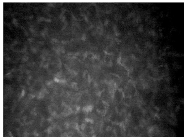
Figure 6. Anterior stroma visible in a keratoconic eye with grade 2 haze imaged with confocal microscope