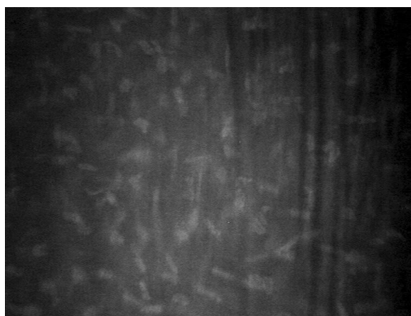
Figure 9. Thick dark bands visible in posterior stroma of a stage 2 keratoconic eye with imaged with confocal microscope