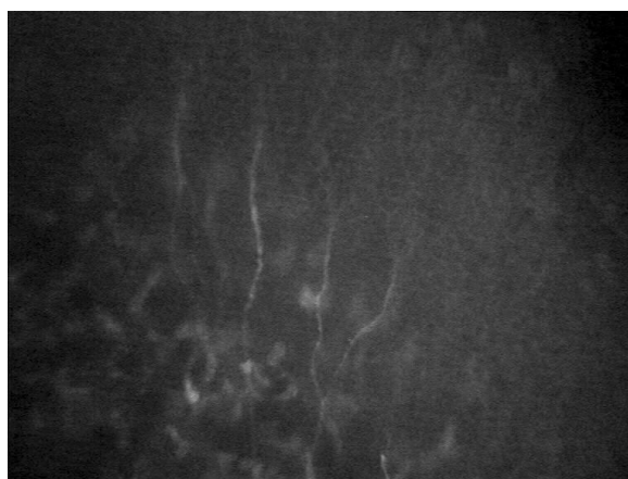
Figure 2. Bowman's layer of a stage 3 keratoconic eye imaged with confocal microscope