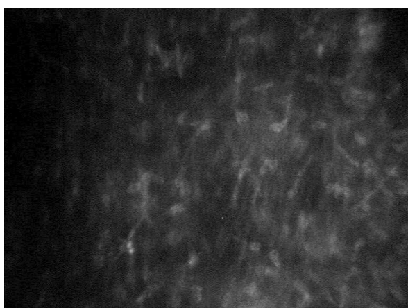
Figure 8. Elongated keratocyte nuclei visible in anterior stroma of a stage 3 keratoconic eye with imaged with confocal microscope

(Figure 9). The comparison of stromal haze, polymegathism, and pleomorphism of the corneal endothelium among stage 1, stage 2 and stage 3 keratoconus is presented in Table 1.