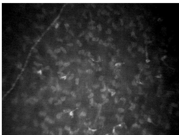
Figure 7. Keratocyte nuclei visible in anterior stroma of a control eye imaged with confocal microscope