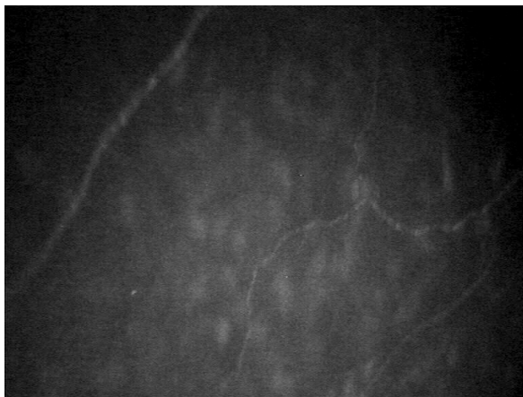
Figure 4. Sub-basal nerve fibers visible in a keratoconic eye imaged with confocal microscope

The stromal layer was clearly visible in all healthy eyes with no haze (Figure 5), but a different degree of stromal haze was observed in the keratoconic eyes (Figure 6). Anterior stromal keratocyte cells were visible in all keratoconic eyes with grades 0, 1, 2 and 3 stromal haze in 7 (14.9%), 18 (38.2%), 20 (42.5%) and 2 (4.2%) eyes, respectively.