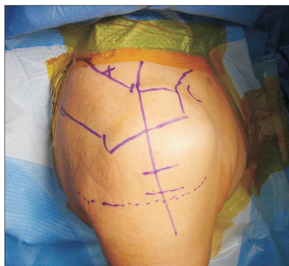
Fig. 3. Suprascapular nerve block (SSNB) was performed before surgical procedure in group 2 with the patient positioned in a beach chair. The X mark indicates the introducing point of SSNB, which is located in the middle between the anterolateral edge of the acromion and the superior edge of the medial scapular spine. Bony landmark was outlined with blue line.

If an increment of the VAS score for pain was observed in the patient between 1 and 48 hours after arthroscopic rotator cuff repair, rebounding postoperative pain was suspected. 2,10) VAS score for pain, satisfaction score of the patients was measured 4, 8, 12, 24, 36, and 48 hours postoperatively. VAS score for pain was rated from 0 (no pain) to 10 (most severe pain). 2) Satisfaction score of the patients was also rated from 0 (unsatisfactory) to 10 (most satisfactory). 5)