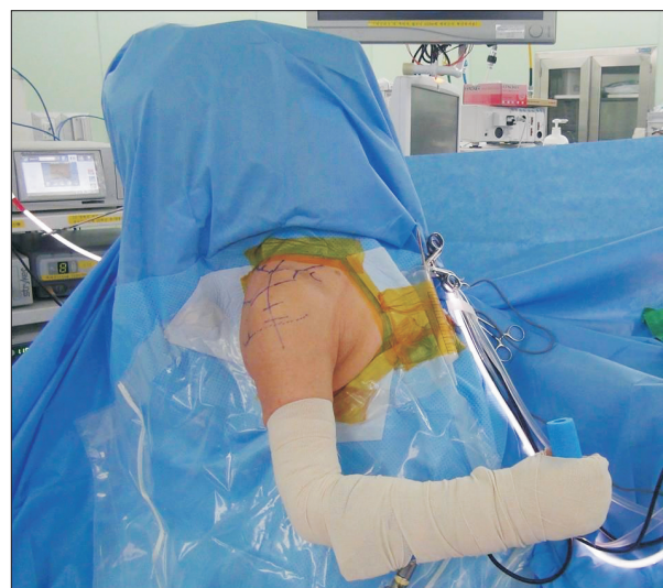
Fig. 2. Beach chair position.

Patients were placed in the beach chair position in the operating room. Preemptive SSNB, axillary nerve block and intraoperative SSNB were performed under arthroscopic guidance in group 1 and preoperative SSNB was performed without guidance in group 2. PCA was set at a fixed dose: continuous dose, 0.5 mL/hr; total volume, 60 mL (fentanyl + necupam + normal saline [NS] + Nausea injection [0.6 mg; PT Astellas Pharma Indonesia, Jakarta, Indonesia]); loading dose, 0.5 mL; and lockout time, 15 min.