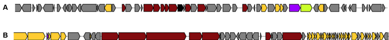
Figure 3. ARTS cluster visualizations from example genome Streptomyces roseochromogenes DS 12.976 where core genes are shown in yellow, known resistance in green and hits for both shown in purple. (A) Purple: positive control of resistant gyrB , Green: DNA topoisomerase IV (B) Example of cluster boundaries capturing core genes not associated with the cluster.