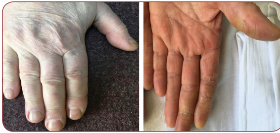
FIGURE 4. Erythema on the palmar and dorsal aspects of hands, including the fingers and nail folds, with desquamation, hyperkeratosis and fissures

for hands and feet, cooling with cold water or a cold damp towel, avoiding heat generators, saunas, sun exposure, use of thick socks or gloves, avoiding contact with chemical substances (e.g., laundry detergent, domestic cleansing products) and limiting any physical strain that may lead to pressure or friction on palms and soles.