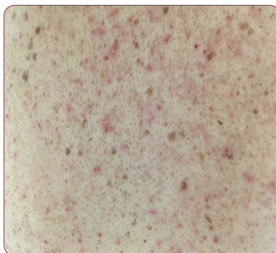
FIGURE 1. Skin rash consisting of erythematous papules and pustules after anti EGFR therapy (Cetuximab)

The most frequent cutaneous reaction is the dose-dependent acneiform rash, located on the face, scalp and upper trunk, with a prevalence of 49-67% of patients treated with Erlotinib (Figure 1) and 75-91% of patients treated with Cetuximab (Figure 2). Skin lesions usually appear in the first two weeks of treatment, diminishing in intensity in the following two weeks. Most commonly they occur after the administration of monoclonal antibodies. Acneiform reactions consist of erythematous papules, pustules and nodules, located predominantly on seborrheic areas, and may be associated with pruritus, pain, stinging and irritation. Pruritus may affect more than 50% of patients, leading to major discomfort. Comedos, a distinctive mark of acne vulgaris , are absent (1, 4-6).