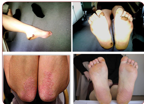
FIGURE 3. Up: vesicles and tension bullae on a well defined erythematous background on soles (HFS); lower left: well defined erythemato-squamous plaques on elbows; lower right: well defined erythematous plaques on soles

Preventive measures against hand-foot syndrome include limitation of hot water usage