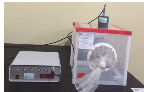
FIGURE 3: Setup of the Hemotek membrane feeding system.

The blood samples were stored at 4°C after adding ethylene diamine tetraacetic acid (EDTA) as an anticoagulant (EDTA : blood = 1 : 100) until taken for experiments. Prior to the experimental trials, blood samples were kept at room temperature for 30 minutes and introduced to the female