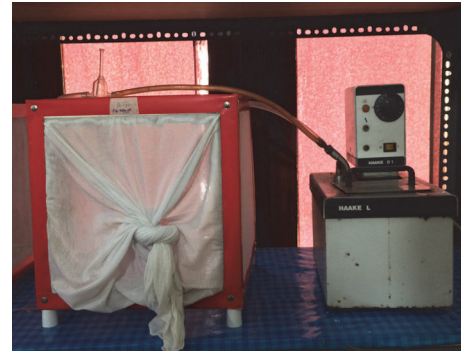
FIGURE 1: Setup of the glass plate method.

2.1. Establishment of Ae. aegypti Colony. A mosquito colony of Aedes aegypti was established from five blood-engorged wild females caught from the field (Ragama Medical Officer of Health area) and was maintained under a 12:12 (light:dark) cycle. Mosquitoes were reared using standard conditions to generate similar sized individuals. Adult mosquitoes were housed in 24 × 24 × 24 cm mosquito cages with mesh screening on top, provided with a 20% sugar solution and water ad libitum. The colony was maintained at 27 ± 2°C and 75 ± 5% humidity, providing human blood as