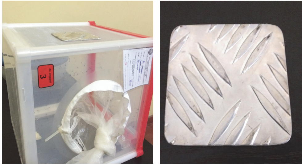
FIGURE 2: Metal plate and the setup of the metal plate method.

2.4. Metal Plate Method. A square shaped metal plate with a rough surface (9 cm × 9 cm: width × length) was prepared. The rough surface of the developed metal plate was covered with a stretched Parafilm-M membrane leaving one side open. Blood was added (3.0 ml) into the space between the plate and the membrane, and the open side was carefully sealed. A small pillow (10 cm × 10 cm: width × length) filled with rice grains was heated up to 40°C using a microwave oven and was placed on top of the metal plate, while keeping blood filled surface down in order to maintain the temperature throughout the time of blood feeding (Figure 2).