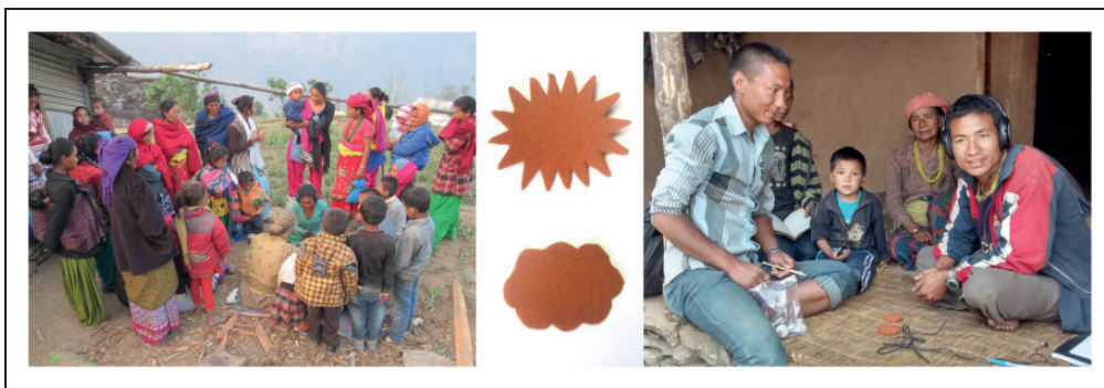
Figure 1. Syuba-speaking participants making kiki/bubu decisions in Nepal, with photographs of the physical object tokens used in decision-making.

counterbalancing of stimulus order was used to reduce potential response bias from onlookers. Instructions were given in Nepali by the second author and a Yolmo-speaking research assistant, and selections were recorded by hand using a paper form.