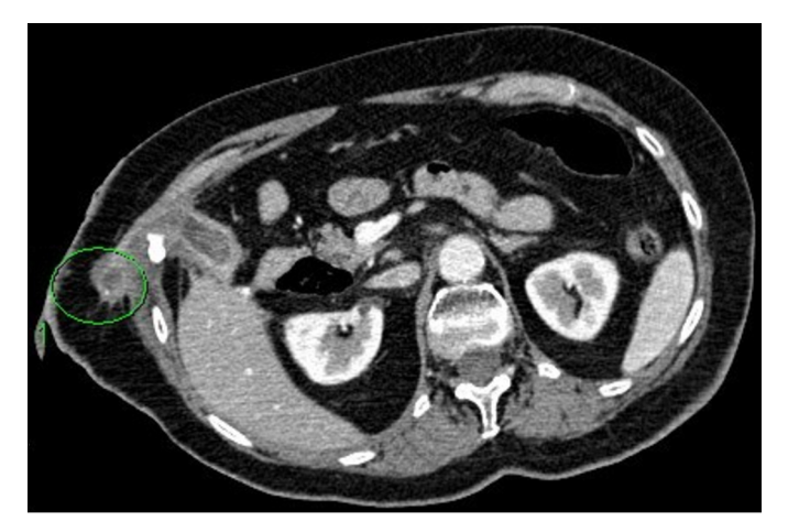
Figure 3. Follow-up CT scan showing the presence of a stone within the tract.