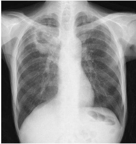
Figure 1. A chest radiograph taken on admission.