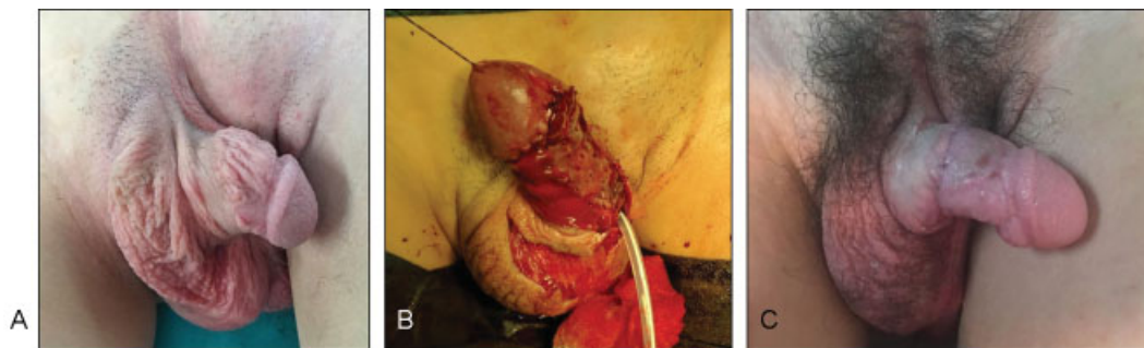
Fig. 4 (A) Lack of penile skin and severe chordee due to a buried penis with only one corpus cavernosum. (B) Reconstruction with dermal matrix and STSG at 14 years of age. (C) Reconstructed penis 1 month after surgery. STSG, split-thickness skin graft.

interventions. There is still an ongoing debate over which type of skin graft should be used to replace the penile skin defect. Sir Harold Gilles suggested in 1917 the core principle of reconstructive surgery: “tissue loss is replacing like with like,” meaning donor tissue should be the one that most closely replicates the native tissue in function and cosmetic appearance. 3 FTSGs show significantly more primary contraction than STSGs, but STSGs present lower incidence of graft failure and have much broader range of application than FTSGs. 2 It should also be noted that during penile reconstructive surgery, the penis should be at full erection, when the graft and dressing are applied, to prevent wrinkling and contracture of the graft, which would lead to rejection of graft. All our patients reported