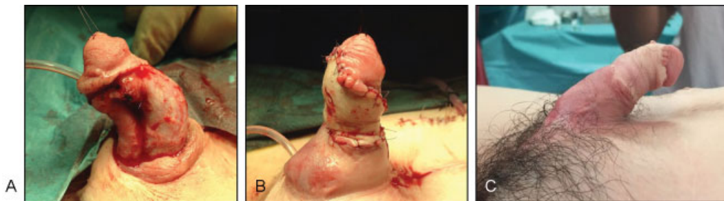
Fig. 3 (A) Lack of penile skin after multiple previous surgeries in a vesical exstrophy patient. (B) Reconstruction with dermal matrix and STSG at 12 years of age. (C) Reconstructed penis 1 month after surgery. STSG, split-thickness skin graft.