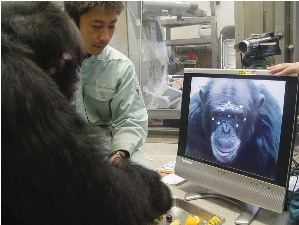
Figure 1. Experimental set-up. A male chimpanzee faces a monitor. Stickers are placed on his face and head.

In step 2, one of the following eight videos (conditions 1–8) was presented for 2 min: a live video (condition 1), a 1 s delayed video (condition 2), a 2 s delayed video (condition 3), a 4 s delayed video (condition 4), a video of the subject that was filmed more than one week prior in which stickers had been placed on the face and head of the subject (condition 5), a video of the subject that was filmed more than one week prior, in which no stickers were present on the face and head (condition 6), a video of a human who had stickers placed on the face and head (condition 7) or a video of a human with no stickers (condition 8). In steps 1 and 2, an experimenter gave a small piece of food about every 20 s to ensure that the chimpanzee remained in a relaxed state to enable recording of their behaviour, regardless of the chimpanzee's behaviour during the test.