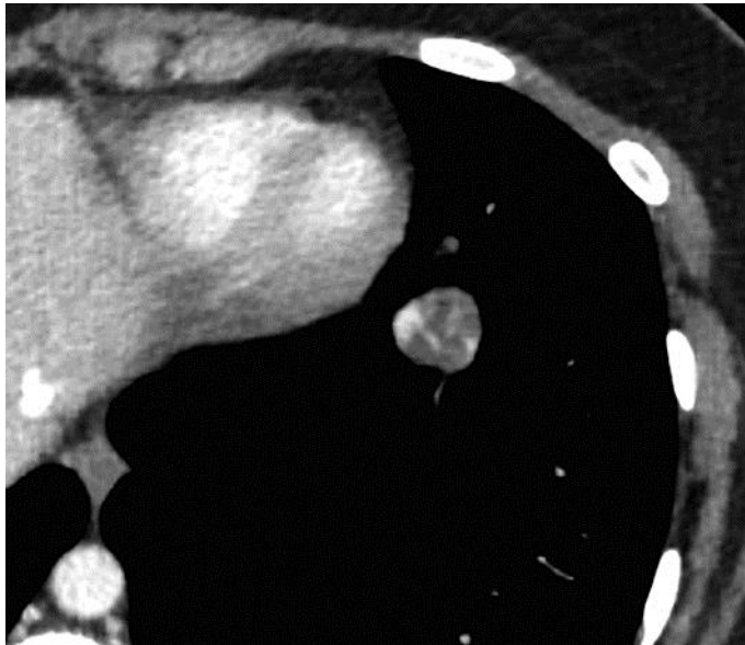
Fig. 1. Axial chest computed tomography image in a 24-year-old female with metastatic choriocarcinoma. Initial enhanced chest computed tomography at presentation shows multiple solid pulmonary nodules with hyperenhancement after intravenous contrast.