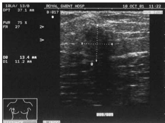
Fig 1 Ultrasonogram showing hypoechoic lesion with irregular margins and acoustic shadowing disrupting normal contours of breast tissue

assumption that the cancer is present at a subclinical level for some time and that pregnancy related hormonal changes promote its growth. These studies noted that the shorter the interval between birth and diagnosis, the poorer the outcomes. 1 w1-w4 Although this evidence indirectly suggests that pregnancy may promote the growth of breast cancer, it does not apply to our patient as her disease was detected at the start of pregnancy. Her previous pregnancy is unlikely to have had an effect on the current disease as it preceded diagnosis by more than four years.