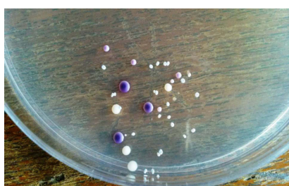
[Table/Fig-5]: Mixed colonies of blue to purple Candida tropicalis and cream to white Candida glabrata isolated from vegetarian participant.

non vegetarians. Mixed colonies of C. krusei , C. glabrata , and C. albicans isolated from a vegetarian participant is depicted in [Table/Fig-4]. Mixed colonies of C. tropicalis and C. glabrata isolated from a vegetarian participant is depicted in [Table/Fig-5]. Among such mixed colonies, the dominant species in most cases of vegetarians were the non Candida albicans species.