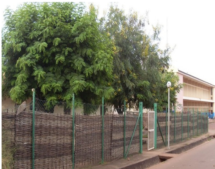
Fig. 1 The former Bissau HIV clinic, located just adjacent to the Simao Mendes National Hospital Maternity ward, surrounded by a bamboo fence to provide 'visual' confidentiality

or shortly after delivery (Table 2; Int-14, Int 21) (Fig. 2). A maternity patient recounted: