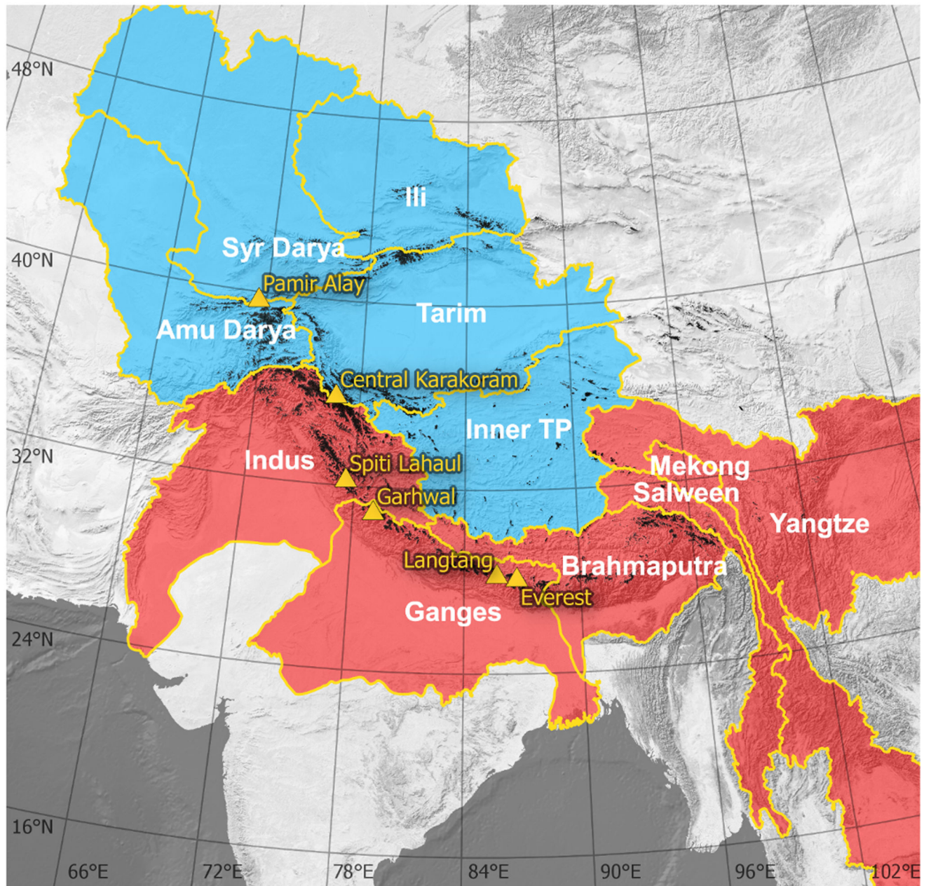
Figure 1. High Mountain Asia major drainage basins.

The endorheic basins are in blue and the exorheic basins in red. The yellow triangles show the validation sites (named after the region or a summit) where we evaluated the glacier mass balance obtained with the ASTER method (see Supplementary Information and Fig. S4-7). The glaciers from the GAMDAM glacier inventory 28 are shown in black.