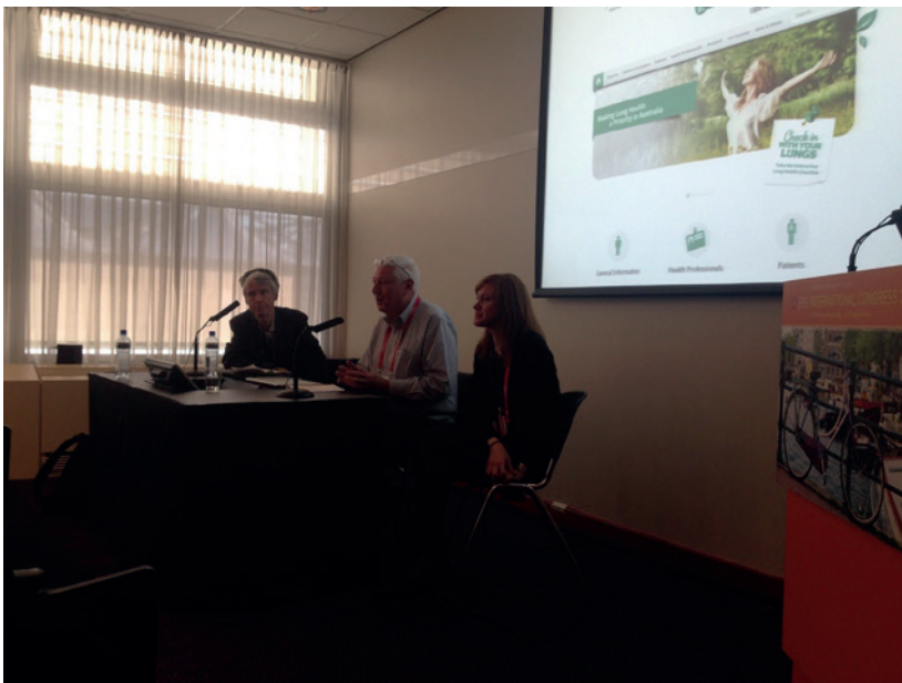
Figure 2 A group of bronchiectasis patients address the EMBARC annual meeting.

There is a significant need for physician education in bronchiectasis, as highlighted by the patient priorities survey, in which one of the top patient priorities was that their primary care physician should have greater knowledge and understanding of their condition [11]. Patients have been integral to the development of a physician education platform that is due for launch in 2017. In addition, patients consistently report a lack of high-quality educational material available for them to understand their own condition. Patients have therefore led the development of a patient education website to be launched by ELF in 2017 to provide high-quality