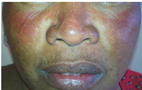
FIGURE 3: Erythema induced by topical corticosteroids.