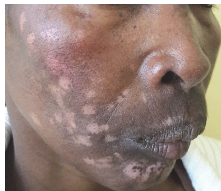
FIGURE 1: Steroid induced hypopigmentation.

*Pigmentation disorders (63,2%) were the most adverse effects noted.