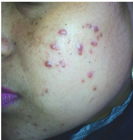
FIGURE 4: Steroid acne.

Malagasy purchasing power was limited to buy luxury cosmetics. This may explain the misuse of topical corticosteroids which is affordable. Potent topical corticosteroids were the most used. We conducted our study only in women because facial care is not yet daily habits for Malagasy men.