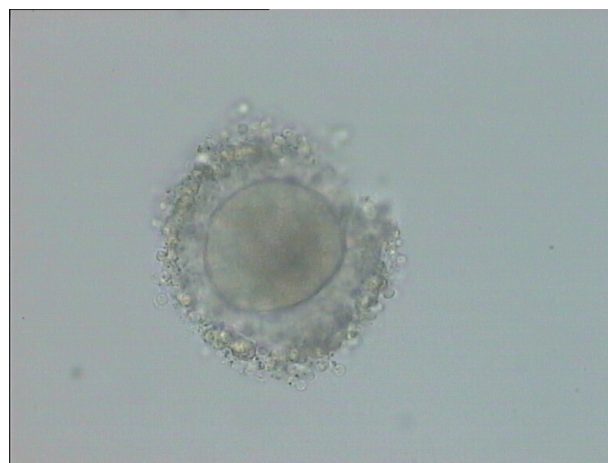
Figure 3: Immature oocytes obtained from ovarian tissue