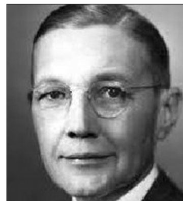
Figure 2: James Papez.