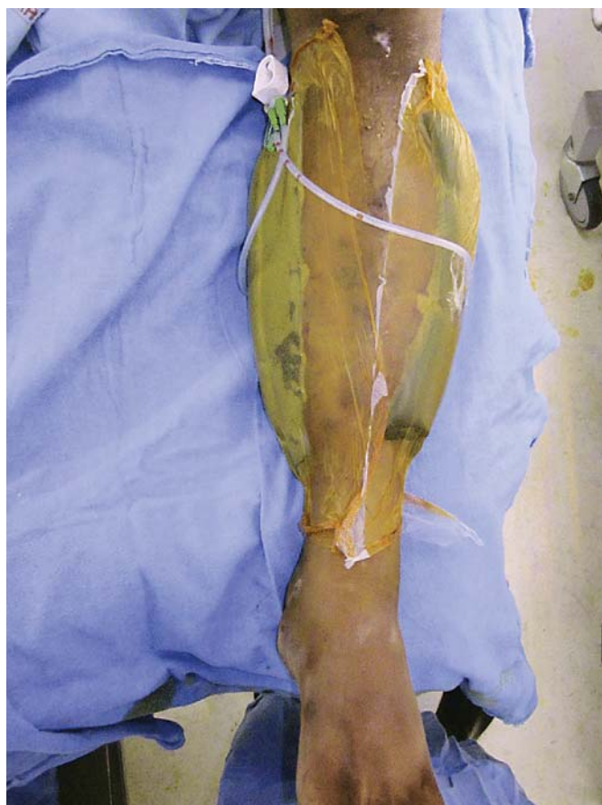
Fig. 2. Clinical picture of the leg showing massive swelling compared to the other leg.