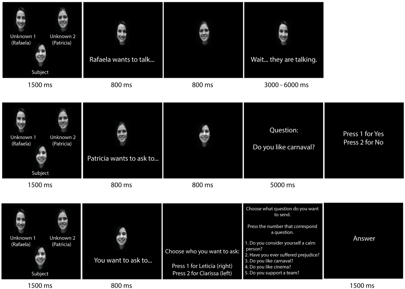
Fig 1. Experimental design of chat room. a) Confederate participants talking between themselves; b) Participant receiving questions from one of the fictitious participants c) The participant chooses one of the fictitious participants to direct a question of their choice. The individuals in this manuscript has given written informed consent (as outlined in PLOS consent form) to publish these case details.

https://doi.org/10.1371/journal.pone.0184215.g001