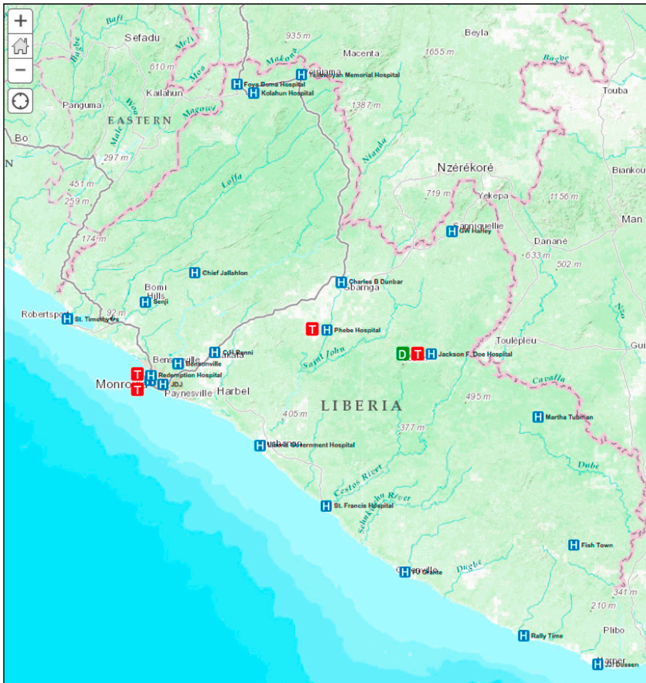
FIGURE 1. Map of Liberia showing location of 21 government hospitals supported and catchment areas surveyed. H denotes hospital T denotes teaching hospital. This figure appears in color at www.ajtmh.org .

traditional healers. There were slight increases in the number of patients seeking care at pharmacies (4–6%), or using home treatments (4%), especially to treat malaria and pediatric illness.