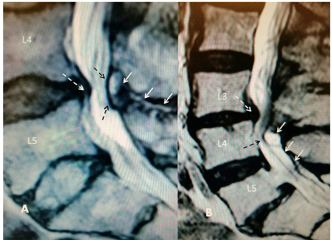
FIGURE 3: T2 sagittal magnetic resonance imaging (MRI): L4-5 disc degeneration with posterior dorsal cyst and interspinous hyperintense fluid

A: Interspinous hyperintense T2 fluid signal at L4-5 (solid white arrows) leading into posterior epidural cyst causing lumbar stenosis (dashed black arrows). There is associated disc desiccation and posterior annular bulging (dashed white arrow).