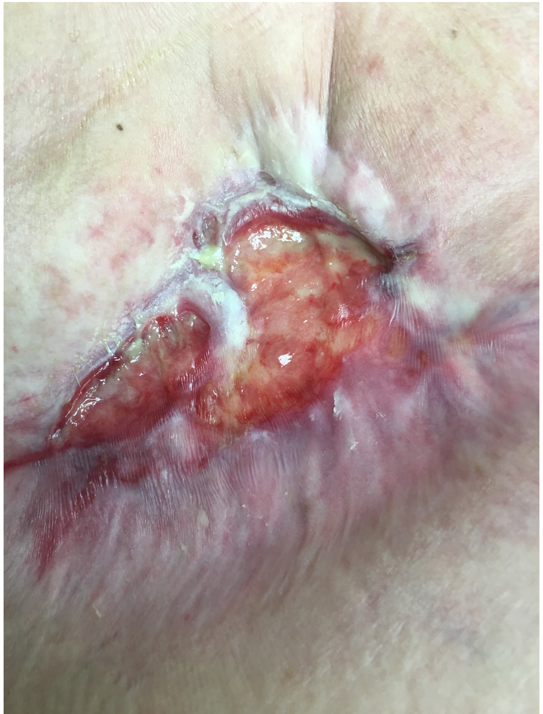
FIGURE 4: Island of epithelium is seen growing across the wound after approximately three months of weekly treatments of urinary bladder matrix (UBM) placements