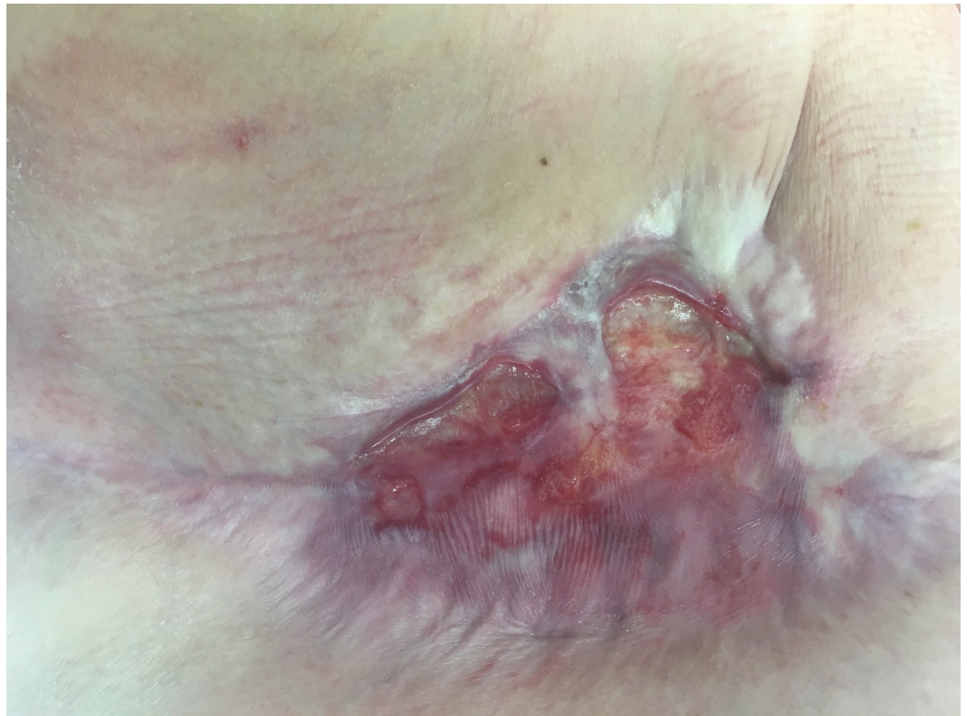
FIGURE 5: Latest picture of mastectomy defect

Six months out from initial porcine bladder matrix placement