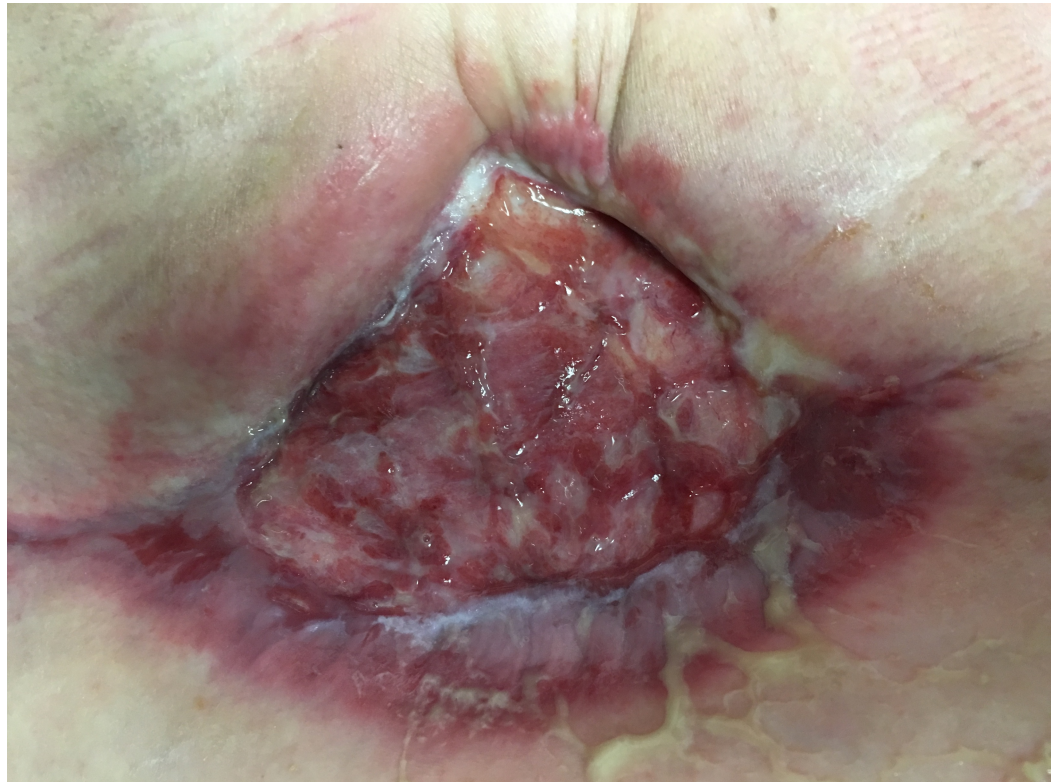
FIGURE 3: Approximately two months since initial implantation of porcine bladder matrix

has decreased in size to approximately 3 cm in length by 2 cm in depth and 2 cm in width (Figure 3). Her pain has completely resolved, and the wound is growing epithelial islands which will eventually cover the entirety of the granulation tissue that is in her wound (Figure 5).