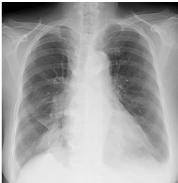
Figure 1. Chest X-ray showing enlargement of the cardiac silhouette.