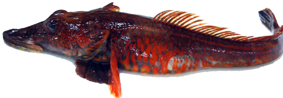
Figure 1: Photograph of Antarctic dragonfish, P. charcoti .