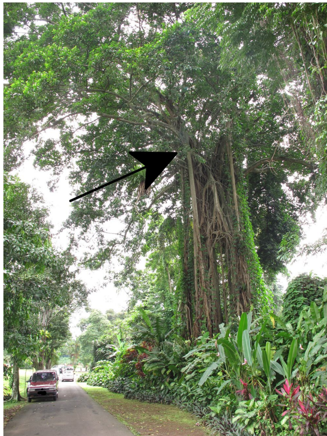
Figure 3. Image of a F. elastica hemi-epiphyte in the Kebun Raya Bogor (Bogor Botanical Garden). The arrow shows the point at which the aerial roots connect with the short trunk and branches, and indicates the point of attachment of the original epiphytic seedling.

elastica in plantations would have created a huge, widespread population of hosts, even considering that a large proportion were probably sterile.