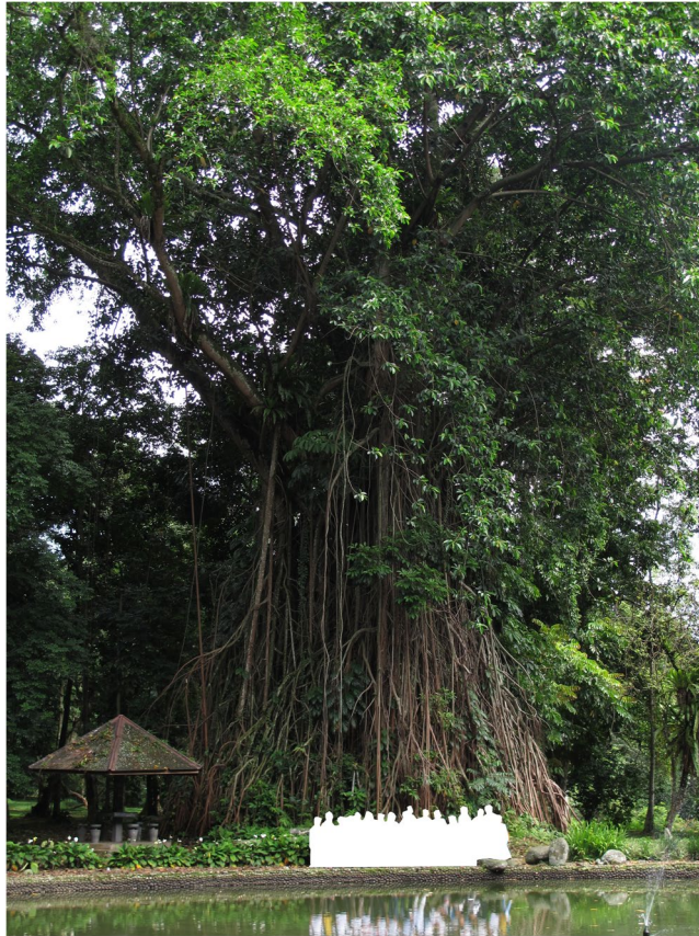
Figure 4. Image of a large F. elastica individual from Kebun Raya Bogor (Bogor Botanical Garden).

other fig species that have been transported around the world via the horticultural trade, yet are pollinated by the 'correct' fig wasp species many thousands of miles outside their natural range 37–39 . In these cases, presumably the pollinators were also transported via the horticultural trade, as larvae in developing figs. The ability of figs to wait for their specific pollinator to catch up over decades, and possibly centuries, has likely contributed to the stability of the interaction over evolutionary time-scales as different lineages dispersed around the globe 22 . Thus, after an extended period of abstinence, India Rubber has rediscovered sex in Singapore.