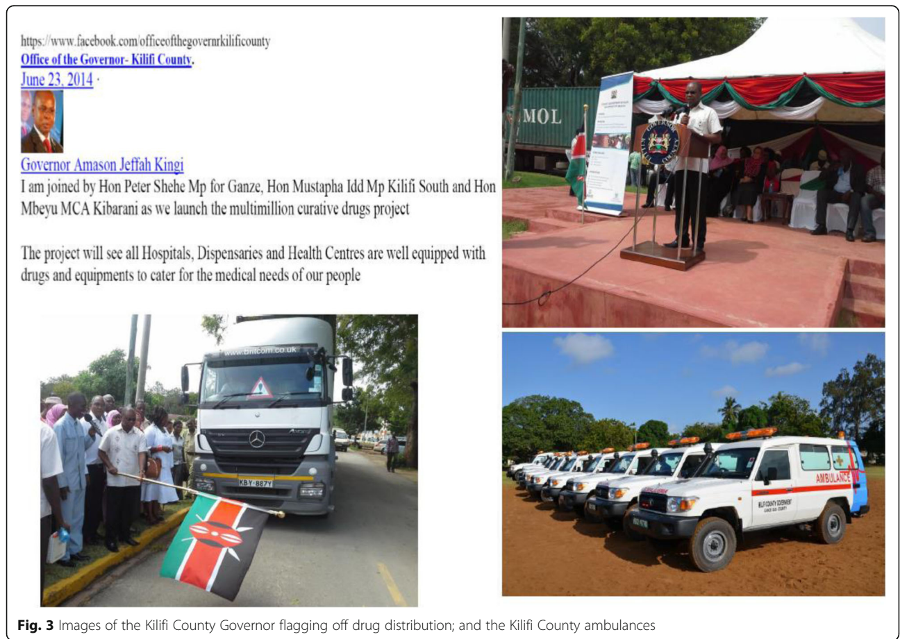
Fig. 3 Images of the Kilifi County Governor flagging off drug distribution; and the Kilifi County ambulances

Omar [4] argued that the political drivers and context that push a country to adopting decentralized governance arrangements have a major bearing on how decentralization gets implemented in that setting [4]. From our findings, the political context in Kenya caused the transfer of devolved health sector functions to be done faster than had been anticipated by most health sector players (Tsofa B, et al.: How does decentralisation affect health sector planning and financial management? A case study of early effects of devolution in Kilifi County, Kenya, submitted) [25]. This happened at a time when the county governments had not set up their organizational structures and built capacity for these structures to undertake their functions, causing