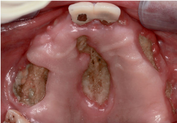
Fig. 1: Maxillary osteonecrosis in a patient with prostate cancer and bone metastasis treated with Zometa™ (Zoledronic Acid).

The first evidence in the literature about osteonecrosis of the jaws (ONJ) derived from a treatment with bisphosphonates (BPs) was in charge of Marx in 2003. Since then, documented cases have been taking place in recent years considering the pathology as a major complication as a consequence of the use of this family of drugs (Fig. 1) (1-3).