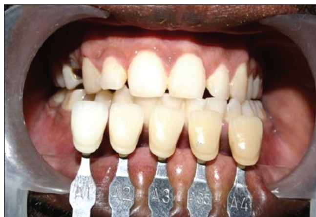
Figure 1: Visual shade selection using a VITAPAN® classical shade guide

After retracting the patient's cheek with a cheek retractor, a circular cut out from 18% gray card (which was dipped in 25% alcohol for disinfection) was placed on the patient's left central incisor with the help of petroleum jelly. The vertical arm of the camera stand was adjusted at the level of the patient's occlusal plane. The optical axis of the camera was oriented perpendicular the patient's frontal plane. [9] The distance between the camera and the patient was 70 cm to