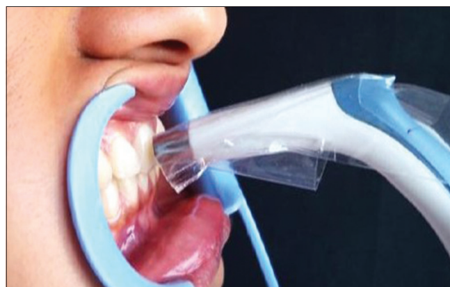
Figure 2: Shade selection using a VITA Easyshade spectrophotometer