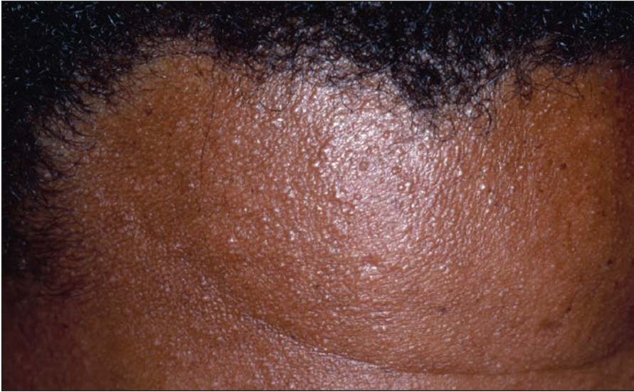
FIGURE 1. Acne and larger pores are often attributed to oily skin.