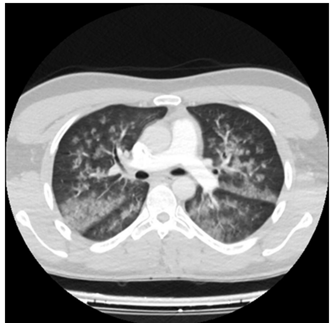
Fig. 2. Complete-incomplete consolidation with alveolar distribution was observed in both lungs especially in the upper and middle lobes.

Although there are some reports of respiratory distress that occurred with the discontinuation of treatment, according to our best knowledge, this is the first report of ARDS in a patient with primary myelofibrosis who receiving ruxolitinib. Thus, ARDS should be considered in the cases who were on treatment with ruxolitinib who develop respiratory symptoms.