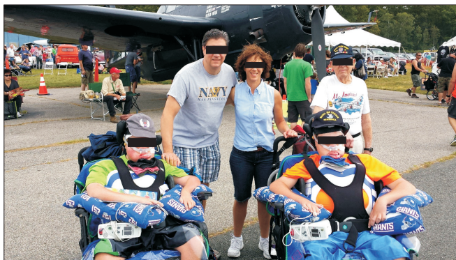
Fig. 3. Twenty- and 19-year-old brothers with severe spinal muscular atrophy type 1, continuously dependent on noninvasive ventilatory support since 8 and 4 months of age, respectively, with no measurable vital capacities. The patients have received all nutrition via nasogastric tubes placed at 4 months of age. They drool but do not aspirate.

hypercapnia that can eventually result in cor pulmonale and symptoms of \text{CO}_2 narcosis. Bicarbonate retention by the kidneys compensates for the effect of \text{CO}_2 retention on blood pH but this also depresses central ventilatory drive and allows the brain to accommodate to hypercapnia without overt symptoms of acute ventilatory failure. Supplemental \text{O}_2 administration further exacerbates hypercapnia by ventilatory depression and by the Haldane effect by which oxygenation of hemoglobin dissociates hydrogen ions from it, shifting the bicarbonate buffer equilibrium to \text{CO}_2 formation. The \text{CO}_2 released from red blood cells exacerbates hypercapnia. The hypercapnia associated with \text{O}_2 therapy commonly results in ventilatory arrest. If, on the other hand, NVS is administered instead of \text{O}_2 , symptoms can dissipate, blood gases return to normal, excess bicarbonate ions are excreted, and ventilatory drive normalizes.