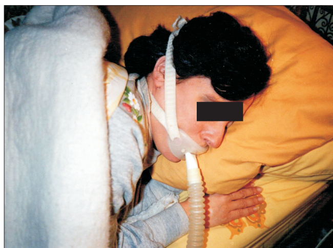
Fig. 2. A 68-year-old woman, spinal cord injured at birth, began sleep noninvasive ventilatory support via lipseal, seen here, in 1977 and began to require daytime mouthpiece NVS in 2004 and continuous NVS since 2010.

The Thompson Bantam ventilator, on the market in the United States since 1957, could only deliver pressure preset control ventilation. Portable volume preset ventilators were not to be available until 1976. The over 250 GMH NVS users with advanced NMDs were receiving air at 18 to 30 cmH 2 O pressures irrespective of their vital capacities (VCs) or autonomous tidal volumes. This included patients with no VC. It was clear that lung insufflation pressures over 15 cm H 2 O were needed to rest respiratory muscles and provide ventilatory support for patients with little or no VC. Without CNVS these patients would either still be in iron lungs around-the-clock or, more likely, would have undergone tracheotomies and by now be dead from complications related to the tube since four out of five patients with some NMDs using tracheostomy mechanical ventilation (TMV) die from tube related complications [2]. Besides prolonging survival, noninvasive management also preserves quality of life. Further, since all children under age 18 with tracheostomy tubes, even those having no physical disabilities or ventilator use, are 'entitled' to 16 hours per day of nursing care and TMV users are entitled to 16 to 24 hours per day of nursing care at $380,000 to over $500,000 per year, cost savings in the United States can exceed $400,000 per year per individual CNVS user. Despite all the advantages of noninvasive