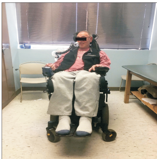
Fig. 1. A 61-year-old man with ALS dependent on sleep nasal noninvasive ventilatory support since 2014 and on daytime NVS via 15 mm angled mouthpiece as well, seen here, since February 2016.

It was my responsibility to write daily medical progress notes on each patient, many of whom had been medically stable there since 1954. This took imagination. Remarkably, some of the GMH acute poliomyelitis survivors (PPSs) of the 1940s and 1950s are still alive today and using CNVS [1]. Many PPSs and high level spinal cord injured (SCI) patients quit iron lungs in 1954 in favor of mouthpiece CNVS and were never again hospitalized for respiratory difficulties. In 1977 about 40 of them left GMH for apartments in New York City and manage their own personal care attendants (PCAs) which many continue to do today. Most of these CNVS users have had little or no active muscle movement below their necks and no ability to breathe without CNVS from their portable mechanical ventilators except by glossopharyngeal breathing (GPB).