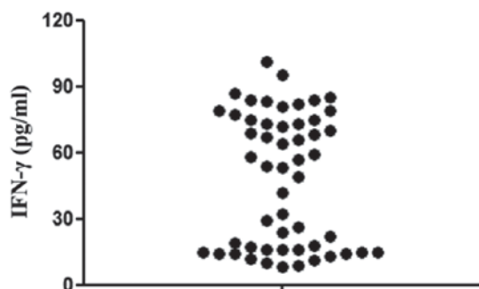
Figure 1. Density of IFN- \gamma in peripheral blood serum of all patients was determined by ELISA. IFN- \gamma , interferon- \gamma .

No significant differences were observed for these parameters, P>0.05 . Data are presented as mean \pm standard deviation, unless stated otherwise. IFN, interferon- \gamma ; AST, aspartate transaminase; ALT, alanine transaminase.