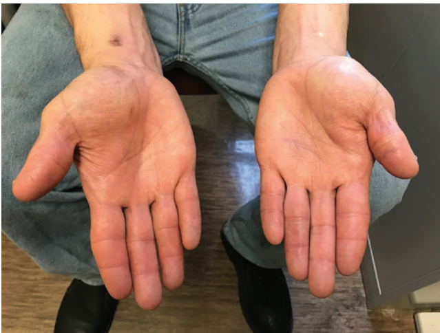
Figure 4. Photograph of patient with acquired immune deficiency syndrome with bilateral, disabling dactylitis and tenosynovitis after 9 months of therapy for Mycobacterium haemophilum .

Mycobacterium haemophilum is a slow-growing, fastidious organism that grows best at 30°C (like Mycobacterium marinum and Mycobacterium ulcerans ) and requires supplementation of iron or hemin [1]. Mycobacterium haemophilum resides in the