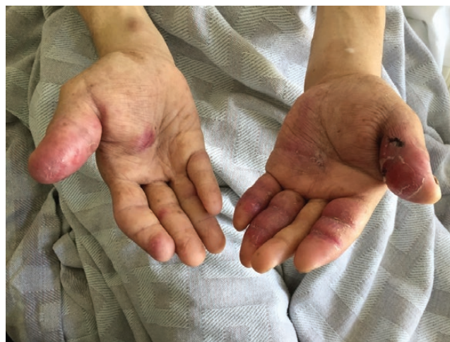
Figure 1. Photograph of patient with acquired immune deficiency syndrome with bilateral, disabling dactylitis and tenosynovitis 1 month after reinitiation of antiretroviral therapy.

© The Author 2017. Published by Oxford University Press on behalf of Infectious Diseases Society of America. This is an Open Access article distributed under the terms of the Creative Commons Attribution License ( http://creativecommons.org/licenses/by/4.0/ ), which permits unrestricted reuse, distribution, and reproduction in any medium, provided the original work is properly cited. DOI: 10.1093/ofid/ofx165.