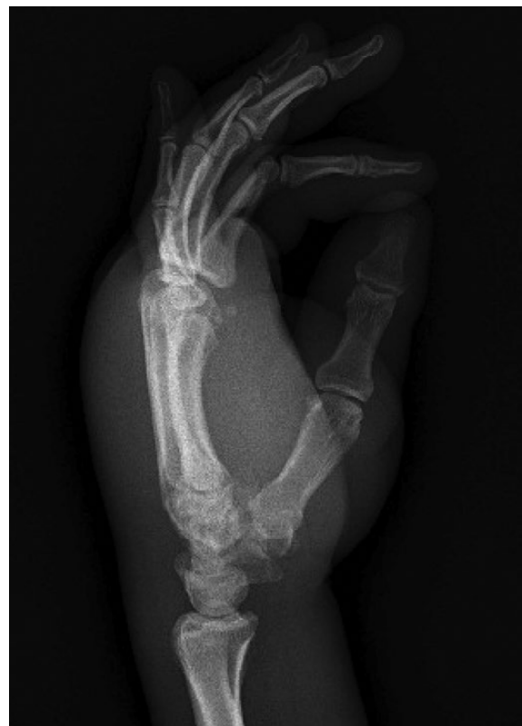
Figure 2. Left hand radiograph without fracture or joint disease illustrating degree of diffuse soft tissue swelling.