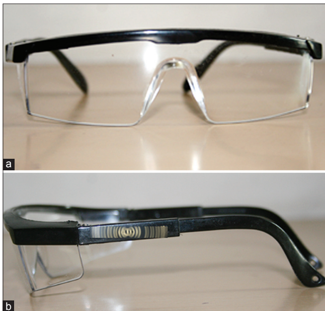
Figure 1: The safety eyewear or goggles used in the study, a) from the front and b) from the sides

All workers were provided with a pair of nontinted polycarbonate goggles with side covers (Innovision Ltd., Mumbai, India), [Fig. 1a and b]. The distribution of goggles was done in October 2010 before harvesting, because the highest frequency of ocular injuries is reported during this phase. [9-13] While harvesting manually, the worker needs to bend forward from the waist [Fig. 2a] which predisposes the