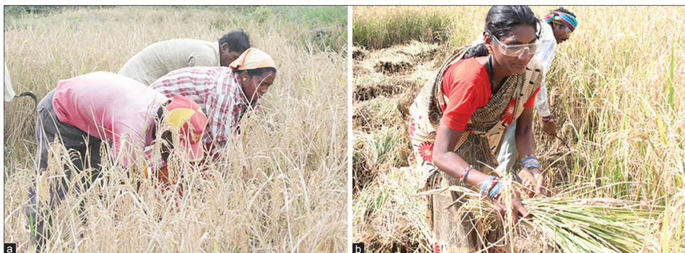
Figure 2: Agriculture-workers harvesting paddy without goggles (a) and with goggles (b)

and 251 (46.5%) females in Group B with a mean age of 40.9 \pm 13.9 years. The groups were homogeneous in terms of age ( P = 0.67 ) and gender ( P = 0.77 ).